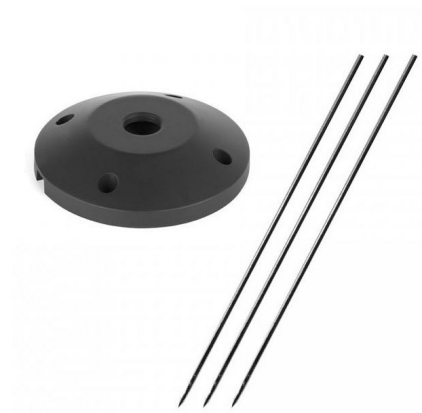
Shown in bronze on aluminum

Landscape Surface Mount Flange / Stake includes three 7 inch threaded stainless steel stabilizing pins for ground mounting or surface mounts with four screws or over a junction box. Designed for use with WAC Lighting landscape lighting products.