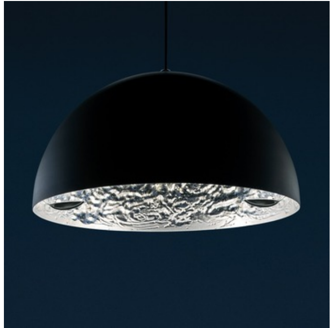
Shown in: Silver Leaf / Black

Stchu-Moon separates the light source from the lighting object, which takes on its own aesthetic quality as a result. The light is refracted off deliberately irregular surfaces, which multiplies their quantity, making the entire object a glowing light.