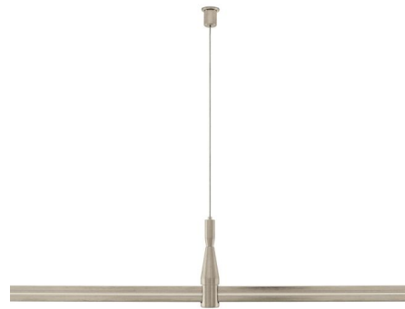
Shown in satin nickel

Monorail adjustable standoffs feature a clean and minimal look. Best suited for straight runs. 12 feet of field-cuttable aircraft cable is adjustable with integral wire grip. Place a standoff every 3 feet on the rail system. For best appearance, place a standoff near the end of the run and at every point where joining two pieces of Monorail together. ETL listed. Note: Limited quantities available in Bronze finish.