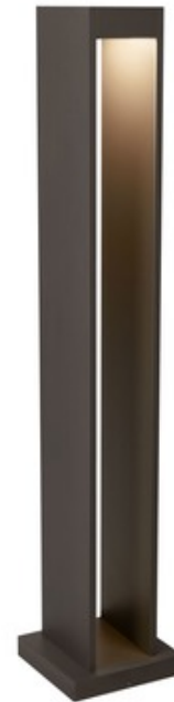
Shown in: Bronze

The Syntra Bollard exhibits a modern, Zen-like design approach blending seamlessly into contemporary architecture and landscapes. The symmetric down lighting provides abundant outdoor illumination while the clean, angular aesthetic maintains an understated elegance. Constructed of aluminum with a durable, marine grade powder coat finish in Charcoal or Bronze. Features stainless steel hardware and impact-resistant, UV stabilized acrylic lens for added durability and stability. Includes 28.9 watt LED module in two color temperature options. Universal 120-277V driver with integral surge protection. 5-year warranty. Dimmable with an electronic low voltage or 0-10V dimmer, sold separately. Available with a button photocontrol, button photocontrol and in-line fuse, in-line fuse, or standard with no options.