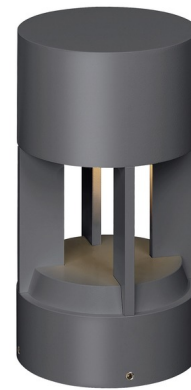
Shown in charcoal / frosted

LAMP LIFE . . . . . 70000 hours COLOR RENDERING . . . . . 80 CRI LAMP COLOR . . . . . 3000K LUMENS/WATT . . . . . 61.90 LUMINOUS FLUX . . . . . 1009 lumens