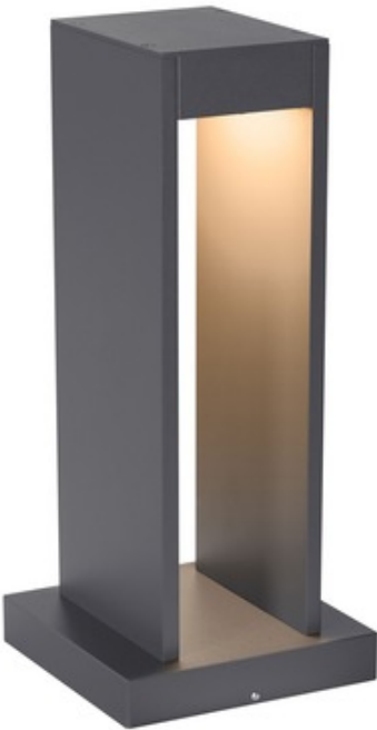
Shown in: Charcoal

The Syntra Path Light exhibits a modern, Zen-like design approach blending seamlessly into contemporary architecture and landscapes. The symmetric down lighting provides abundant outdoor illumination while the clean, angular aesthetic maintains an understated elegance. Constructed of die cast aluminum with a durable, marine grade powder coat finish. Features stainless steel hardware and impact-resistant, UV stabilized acrylic lens for added durability and stability. Bolt mount. Note: Required 12 volt outdoor rated remote low voltage magnetic transformer sold separately.