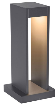
Shown in charcoal

LAMP LIFE . . . . . 70000 hours COLOR RENDERING . . . . . 80 CRI LAMP COLOR . . . . . 3000K LUMENS/WATT . . . . . 20.00 LUMINOUS FLUX . . . . . 256 lumens