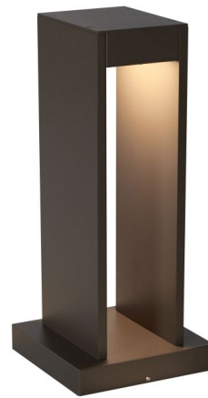
Shown in bronze

The Syntra Path Light exhibits a modern, Zen-like design approach blending seamlessly into contemporary architecture and landscapes. The symmetric down lighting provides abundant outdoor illumination while the clean, angular aesthetic maintains an understated elegance. Constructed of die cast aluminum with a durable, marine grade powder coat finish. Features stainless steel hardware and impact-resistant, UV stabilized acrylic lens for added durability and stability. Bolt mount. Stake kit includes 1.7 inch diameter x 8.3 inch height stake anchor. Note: Required 12 volt outdoor rated remote low voltage magnetic transformer sold separately.