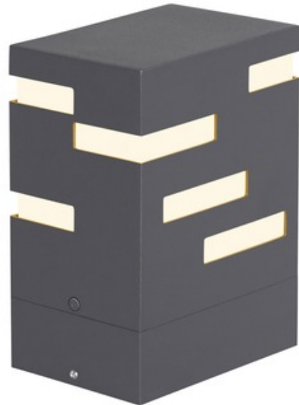
Shown in: Charcoal

The Revel Path Light with Stake Mount Kit features a uniquely modern sleek metal surface that is laser-cut with horizontal slots which allow the LED light to shine through an inner white diffuser. The subtle, ambient glow enhances way-finding on paths or in landscape applications. Constructed of aluminum with a durable, marine grade powder coat finish in Charcoal or Bronze. Features stainless steel hardware and impact-resistant, UV stabilized frosted acrylic lens for added durability and stability. Includes 17.6 watt LED module, 3000K color temperature, 80+CRI, 122.1 lumens. 70,000 hour average lamp life. ETL listed. Title 24 Compliant. Dark Sky Compliant. IP65 rated for wet locations. 5-year warranty. 6 inch width x 8 inch height x 4 inch depth. Includes 1.7 inch diameter x 8.3 inch stake anchor. Required 12 volt outdoor rated remote transformer sold separately.