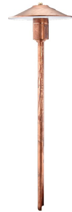
Shown in copper