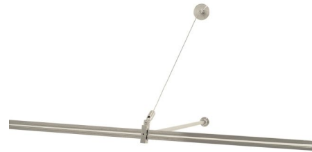
Shown in satin nickel