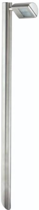
Shown in: Stainless Steel

The Pure LED Border Lite Single Path Light features a single head which can be aimed in different directions, making it ideal for path lighting. Head has a fully adjustable arm allowing 360 degree rotation and 0 to 90 degree elevation. Available in 316 Stainless Steel or powder coat Black or Bronze finish with frosted shatter resistant glass lens. Includes Cree XPG-3 LED module and 12 volt integral Hunza Buckbullet driver (D3=1W/350mA, D7=3W/700mA). Available in three color temperature options. IP56/IP66 rated for wet locations. Required transformer and optional accessories sold separately. Dimmer type dependent on type of transformer/power supply selected (low voltage electronic or low voltage magnetic).