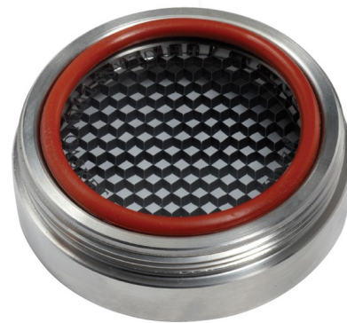
Shown in stainless steel

The Hex Cell Louvre Kit consists of an extension component for the luminaire body, a Hex Cell Louvre insert and an extra clear lens and gasket (O-ring). Available in 316 Stainless Steel, Copper, or powder coat Bronze or Black finish. The main purpose of the Louvre accessory is to protect the eye from the sideways glare emitted from the lamp filament, without dramatically changing the look of the luminaire. When a Hex Cell Louvre is fitted to a fixture it does not affect the IP rating of the luminaire. Optional lens options available, sold separately. IP66/IP68 rated for wet locations.