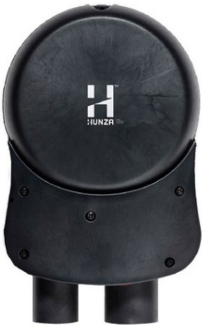
Shown in: Black

The Wall Mount Transformer (100W, or 200W) is a compact above ground, waterproof unit designed to provide 12 volt power for HUNZA low voltage luminaires in landscape lighting installations. Encapsulated toroidal transformer suitable for 120/240 volt 50/60Hz operation. Wall Mount Series transformers have a black, glass-reinforced, UV stable nylon case which provides durability, UV resistance and a low surface temperature. Electrical components are fully encapsulated in the casing for protection against weather and irrigation systems. A key feature of this transformer is multi-tap output providing the choice of 12, 13 or 14 volt secondary output allowing for greater flexibility in compensating for voltage drop on long cable runs. Features thermal protection for the primary side of the transformer with fuse protection for the secondary. 1 inch and 1.25 inch conduit entries to allow for different cable. Dimmable with low voltage leading or trailing edge dimmers, sold separately.