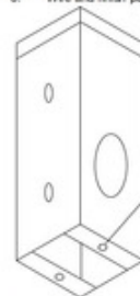
LumenArt Mini Electrical Box

Note: Orient the mounting ears to match your Alume fixture