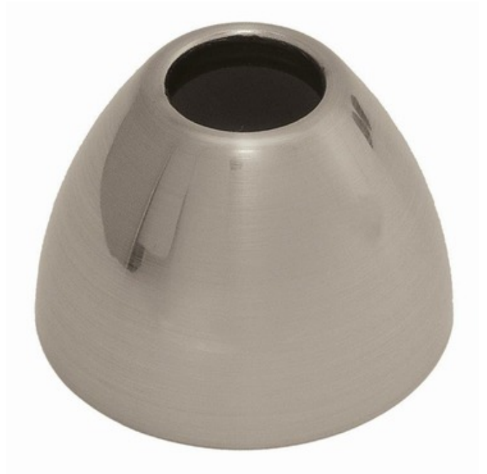
Shown in: Satin Nickel

S1 Little Solid Shade accessory fits on Low Rider or Vespa and holds a single lens or louver, sold separately, using a Snap Louver Lens Holder (included). 12 volt, GU5.3 MR16 lamp up to 50 watts.