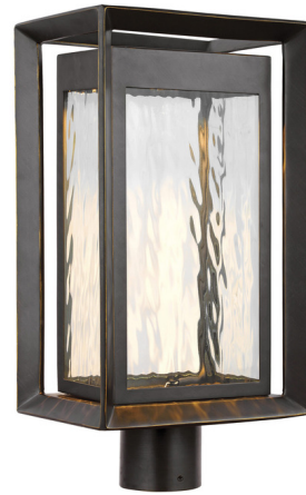
Shown in antique bronze / clear water

LAMP LIFE . . . . . 50000 hours COLOR RENDERING . . . . . 90 CRI LAMP COLOR . . . . . 2700K LUMENS/WATT . . . . . 73.65 LUMINOUS FLUX . . . . . 1915 lumens