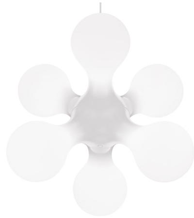
Shown in white / white

The Atomium Suspension draws inspiration from the imagination of science-fiction, featuring an organically formed White molded polyethylene diffuser with an inner structure composed of six light sources fixed on steel coil springs. CE listed and ETL listed.