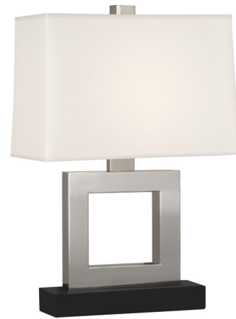
Shown in antique silver / snowflake

The Doughnut Table Lamp packs a punch with its dominant lines and strong geometry. The bold square body sits on a wood base finished in Ebony and is topped with a trapezoidal fabric shade. 3-way turn knob on socket. Note: Natural Brass finish is only available with a Smoke Gray shade.