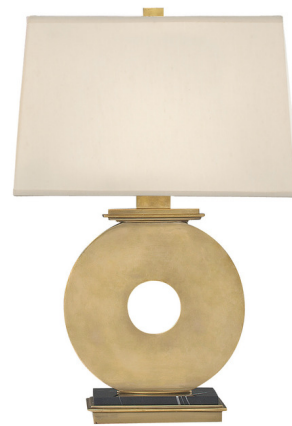
Shown in antique brass

Tic-Tac-Toe Table Lamp features a Pale Shell Dupionis silk shade with an Antique Brass finish on a marble base. One 150 watt, 120 volt A19 3-way medium base incandescent bulb is required, but not included. UL listed.