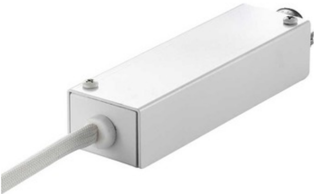
Shown in: White

TL601E-60 12 Volt 60 Watt Electronic Surface Mount Driver/Transformer is rated for 0.5 to 60 watts incandescent or LED total load, 120VAC input. Available in a 10, 25, 60 or 75 watt option. Made of 18 gauge die formed steel with powder coat finish available in White or Black. Supplied with die-cast fitting for 3/8 inch flexible metal conduit. 18 inch lead wires provided to connect output to trac feed connector. Driver should be mounted within 18 inches of track and maximum run length from driver input should not exceed 21 feet. Replaceable fuse on primary. Incandescent loads can be dimmed with high quality dimmers designed for use with electronic transformers. LED loads may be dimmed using only dimmers that have been tested and qualified by Juno for use with Juno LED fixtures including: Leviton Acenti ACE06-1L, Lutron Diva DVELV-300P, Lutron Nova T NTELV-300, Lutron Maestro MAELV-600, Lutron Skylark SELV-300P, Lutron Faedra FAELV-500, or Lutron Spacer SPSELV-600. UL listed. Suitable for damp locations. 5.5 inch length x 1.5 inch width x 1.1 inch height. For use with Juno Trac 12 miniature low voltage track system using LED or incandescent luminaires.