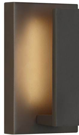
Shown in bronze

The Nate Outdoor Wall Sconce presents a bold, sleek profile inspired by modern lever door hardware. LED light is cast towards the backplate and wall, delivering indirect ambient lighting and a grazing effect on architectural surfaces. Aluminum construction with stainless steel mounting hardware, a powder coat finish, and impact-resistant UV-stabilized frosted acrylic lensing ensure durability against outdoor elements. With its clean look and contemporary finishes, the Nate is suitable for a range of indoor and outdoor spaces. The 9 inch high fixture is ADA compliant.