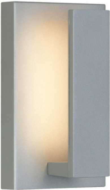
Shown in: Silver

The Nate Outdoor Wall Sconce presents a bold, sleek profile inspired by modern lever door hardware. LED light is cast towards the backplate and wall, delivering indirect ambient lighting and a grazing effect on architectural surfaces. Aluminum construction with stainless steel mounting hardware, a powder coat finish, and impact-resistant UV-stabilized frosted acrylic lensing ensure durability against outdoor elements. With its clean look and contemporary finishes, the Nate is suitable for a range of indoor and outdoor spaces. The 9 inch high fixture is ADA compliant.