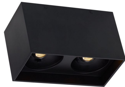
Shown in matte black / black

LAMP LIFE . . . . . 50000 hours BEAM ANGLE . . . . . 20° BEAM SPREAD . . . . . COLOR RENDERING . . . . . 90 CRI LAMP COLOR . . . . . 2700K LUMENS/WATT . . . . . 160.00 LUMINOUS FLUX . . . . . 2240 lumens