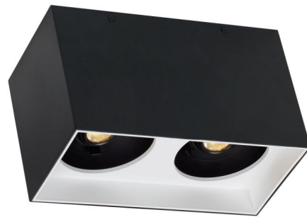
Shown in matte black / white