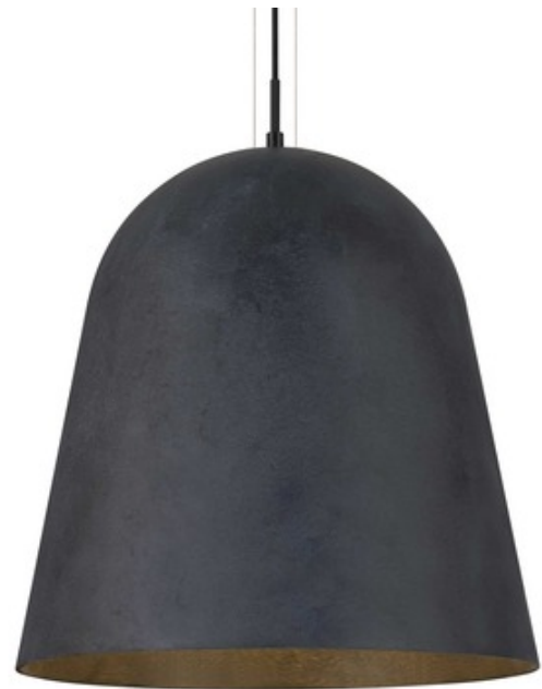
Shown in: Weathered Zinc

The Fett Pendant Light is a significantly scaled pendant light and cohesively blends its characteristic domed silhouette with its incredibly deep, weathered zinc finish. Its wonderfully imperfect signature texture is naturally created during a meticulous molten aluminum sand casting process that results in a noticeably thick shade that projects a truly monolithic presence. One 150 watt, 120 volt G40 medium base lamp is required, but not included. Supplied with twelve feet of field cuttable suspension cable and a 4.5 inch round canopy. ETL listed. 17.7 inch diameter x 18.3 inch height x 162.3 inch overall length.