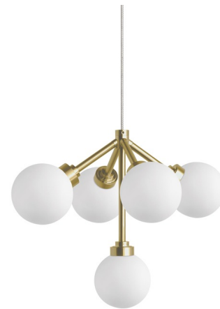
Shown in aged brass / frost white

LAMP LIFE . . . . . 50000 hours COLOR RENDERING . . . . . 90 CRI LAMP COLOR . . . . . 2700K LUMENS/WATT . . . . . 184.80 LUMINOUS FLUX . . . . . 462 lumens