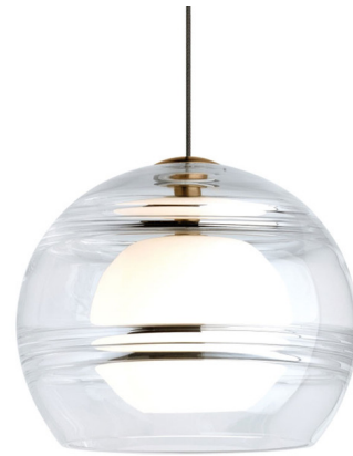
Shown in aged brass / clear