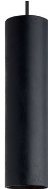
Shown in: Satin Nickel / Weathered Zinc

The Vane Grande Pendant Light takes the ubiquitous metal cylinder and forces it to undergo an intriguing upgrade by introducing an incredibly deep, weathered zinc finish. Its wonderfully imperfect signature texture is naturally created during a meticulous molten aluminum sand casting process that results in a noticeably thick shade which projects a truly iconic spacial impact. Available with LED and incandescent lamp option. LED: Includes 10.8 watt, 120 volt PAR20 medium base LED, 3000K color temperature, 90CRI. Incandescent: One 60 watt medium base PAR20 halogen lamp is required, but not included. Includes six feet of field cuttable suspension cable and a 4.5 inch round canopy. ETL listed. 5.1 inch diameter x 20 inch height x 92 inch overall length.