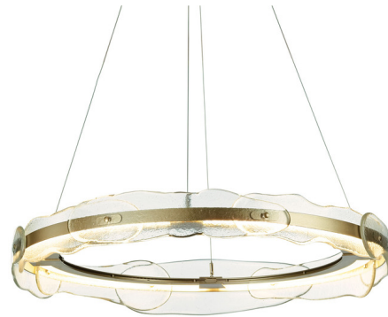
Shown in soft gold / clear

The Solstice Pendant brings an ethereal beauty to your interior space. Hand poured, textured artisanal glass creates warm glowing light against the circular steel plate. Canopy: 9 inch diameter. Slope ceiling adaptable to 45 degrees. Lifetime Limited Warranty when installed in residential setting. Handcrafted to order by skilled artisans in Vermont, USA.