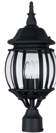
Shown in black / clear

COLOR . . . . . Clear BODY FINISH . . . . . Black WATTAGE . . . . . 120W DIMMER . . . . . Standard 120V DIMENSIONS . . . . . 8"W x 21"H BULB NOT INCLUDED . . . . . 3 x B10/Candelabra (E12)/40W/120V Incandescent