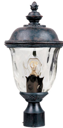
Shown in oriental bronze / water glass

Carriage House DC Outdoor Post Light is made of die cast aluminum and finished with an Oriental Bronze and Water Glass. Available in small, medium, and large sizes. For small, one 100 watt, 120 volt A19 Medium base incandescent bulb is required, but not included. For medium and large, three 40/60 watt, 120 volt B10 Candelabra base incandescent bulbs are required, but not included. Standard post is required, and sold separately. Wet location rated. Small: 9 inch width x 19.5 inch height. Medium: 12.5 inch width x 26.5 inch height. Large: 14 inch width x 29 inch height.