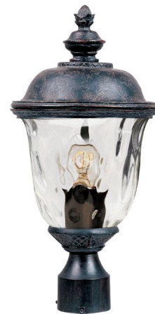
Shown in oriental bronze / water glass

Carriage House DC Outdoor Post Light is made of die cast aluminum and finished with an Oriental Bronze and Water Glass. Available in small, medium, and large sizes. For small, one 100 watt, 120 volt A19 Medium base incandescent bulb is required, but not included. For medium and large, three 40/60 watt, 120 volt B10 Candelabra base incandescent bulbs are required, but not included. Standard post is required, and sold separately. Wet location rated. Small: 9 inch width x 19.5 inch height. Medium: 12.5 inch width x 26.5 inch height. Large: 14 inch width x 29 inch height.