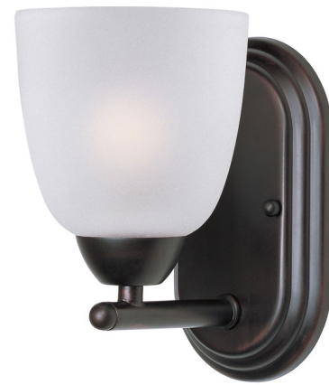
Shown in oil rubbed bronze / frosted

Axis Wall Sconce features intersecting, rectangular tubing in a finished metal that gently curves to support simple Frost glass shades. Can be mounted up or down.