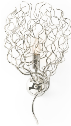
Shown in nickel

The Hollywood Wall Sconce features sculpted metal in an organic design, evocative of bare branched trees. Light reflects off the sinewy branches of this sculptural masterpiece Available in two sizes with Left or Right orientations. Each fixture is a unique, hand crafted piece, and comes with a certificate of authenticity.