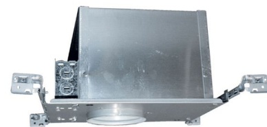
Shown in aluminum

PRODUCT DIMENSIONS . . . . . Ceiling Cutout: 4.50 in HOUSING HEIGHT . . . . . 6" HOUSING TYPE . . . . . New construction IC CEILING TYPE . . . . . Drywall with Trim