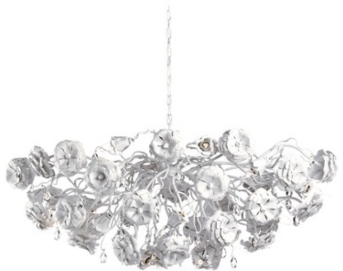
Shown in: Matte White / Crystal

Love You Love You Not Oval Chandelier is made of steel roses and crystals symbolizing the thin line between love gained and love lost - she loves me, she loves me not... Note: All sizes require a special rated junction box for fixtures weighing over 50 pounds. Includes canopy cover for US junction box.