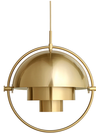
Shown in all brass

The Multi Lite Pendant embraces the golden era of Danish design with its characteristic shape of two opposing outside mobile shades that enable a custom installation and a wide range of lighting in a room. By individually rotating the shades, the Multi-Lite Pendant can be transformed into multiple combinations where the light can be directed upwards, downwards or exude asymmetrical light.