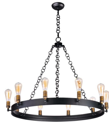
Shown in black

Noble Chandelier is as stately as its name, with heavy weight rings finished in Black supporting cast Natural Aged Brass sockets. Handmade round ring chain is used that adds to the authenticity of this antique reproduction.