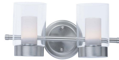
Shown in satin nickel / clear / frosted

LUMENS/WATT . . . . . 173.33 LUMINOUS FLUX . . . . . 1300 lumens