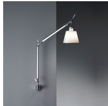
Shown in aluminum / parchment paper

COLOR . . . . . Parchment Paper BODY FINISH . . . . . Aluminum WATTAGE . . . . . 8W DIMMER . . . . . Not Dimmable DIMENSIONS . . . . . 7.25"W x 26"H x 26.75"D BULB NOT INCLUDED . . . . . 1 x A19/Medium (E26)/8W/120V LED COUNTRY OF ORIGIN . . . . . Italy