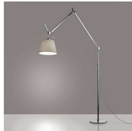
Shown in aluminum / parchment shade

COLOR N/A BODY FINISH Aluminum / Parchment Shade WATTAGE 100W DIMMER Included DIMENSIONS 14.2"W x 93.75"H BULB NOT INCLUDED 1 x A19/Medium (E26)/100W/120V Incandescent OTHER BULB OPTIONS 1 x A19/Medium (E26)/120V LED COUNTRY OF ORIGIN Italy