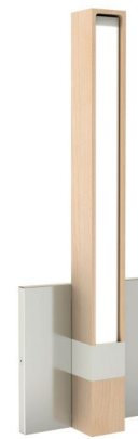
Shown in satin nickel / wood maple

LAMP LIFE . . . . . 50000 hours COLOR RENDERING . . . . . 92 CRI LAMP COLOR . . . . . 2700K Warm Dim LUMENS/WATT . . . . . 54.10 LUMINOUS FLUX . . . . . 284 lumens