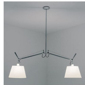
Shown in polished aluminum / parchment paper

COLOR . . . . . Parchment Paper BODY FINISH . . . . . Polished Aluminum WATTAGE . . . . . 300W DIMMER . . . . . Standard 120V DIMENSIONS . . . . . 58.25"L x 51"W x 6.7"H x 10"D BULB NOT INCLUDED . . . . . 2 x A19/Medium (E26)/150W/120V Incandescent COUNTRY OF ORIGIN . . . . . Italy