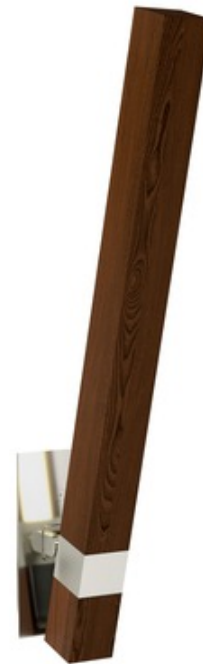
Shown in: Satin Nickel / Wood Walnut

The Tie Stix Wood 1-Light Indirect Vertical Adjustable Wall Light with a 4 Inch Square, 1 Inch Rectangle or 2 Inch Rectangle Canopy features a direct flat, milky white lens and provides an indirect glow. Features an integral hinge for vertical angle adjustment. Available in 12 to 45 inch height options. Channel is available in Maple, Walnut, Cherry, White Oak or Espresso wood finish options. Canopy and hardware are offered in Satin Nickel, Chrome or Antique Bronze. 4SQ canopy mounts to standard 4 inch square electrical box with round plaster ring. 2RE mounts to standard 4 inch electrical box with single gang plaster ring or single gang electrical box. 1RE mounts to Slim Profile Junction Box (included) in new construction applications. Includes 5 watt LED module per foot available in Warm Dim 2700K (27D) or 3000K (30D) color temperature at 100 percent and dims to 2000K. Includes a 24VDC Class 2 electronic low voltage LED power supply. Dimmable with an ELV dimmer: Legrand Adorne ADTP703TU, Lutron Diva DVELV-300P, Lutron Skylark SELV-300P, Lutron Maestro MAELV-600, and Lutron Radio Ra 2). ETL listed. ADA compliant. Suitable for damp locations. Fixture includes a 5 year warranty. Product is built to order.