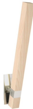
Shown in satin nickel / wood maple

LAMP LIFE . . . . . 50000 hours COLOR RENDERING . . . . . 92 CRI LAMP COLOR . . . . . 2700K LUMENS/WATT . . . . . 53.97 LUMINOUS FLUX . . . . . 299 lumens