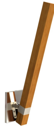
Shown in satin nickel / wood cherry

LAMP LIFE . . . . . 50000 hours COLOR RENDERING . . . . . 92 CRI LAMP COLOR . . . . . 2700K LUMENS/WATT . . . . . 53.97 LUMINOUS FLUX . . . . . 299 lumens