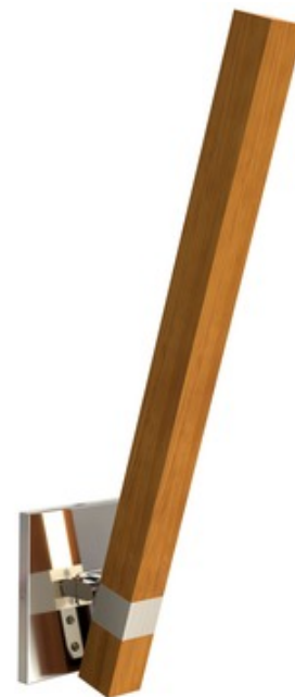
Shown in: Satin Nickel / Wood Cherry

Tie Stix Vertical Indirect Adjustable Wall Light with 4 Inch Square, 1 Inch Rectangle or 2 Inch Rectangle Canopy features a direct flat, milky white lens and provides an indirect glow. Features integral hinge for vertical angle adjustment. Wood finish options include Cherry, Walnut, White Oak, Espresso and Maple. Canopy and hardware are offered in Satin Nickel, Chrome or Antique Bronze finish. Available in 12-46 inch height options. 4SQ canopy mounts to standard 4 inch square electrical box with round plaster ring. 2RE mounts to standard 4 inch electrical box with single gang plaster ring or single gang electrical box. 1RE mounts to Slim Profile Junction Box (included) in new construction applications. Includes 5 watts LED per foot available in a spectrum of color temperature options. Includes a 120V input, 24VDC Class 2 output, electronic low voltage LED power supply, dimmable with an ELV dimmer: Lutron Diva DVELV-300P, Lutron Skylark SELV-300P, Lutron Maestro MAELV-600, Lutron Radio Ra 2, or Legrand Adorne ADTP703TU. ETL listed. ADA compliant. Suitable for damp locations. Fixture includes a 5 year warranty. Product is built to order.