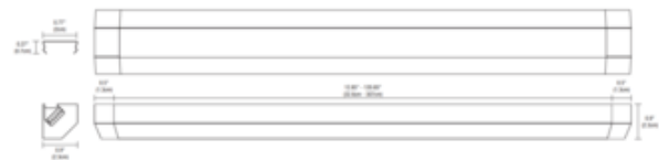
Light Channel 45° DIY System Overview