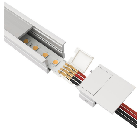
Shown in satin aluminum / clear lens