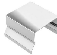
Shown in satin aluminum

Light Channel Millwork Mounting Clip (included and sold separately). Mounting clips included with every two feet of Light Channel Millwork. Finish: Satin Aluminum. Compatible with Edge Lighting Light Channel Millwork.