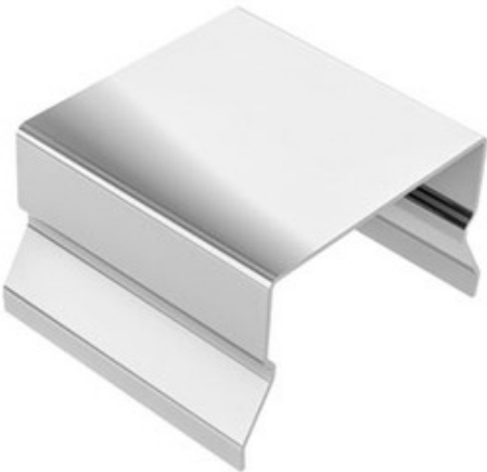
Shown in: Satin Aluminum

DESCRIPTION Light Channel Millwork Mounting Clip (included and sold separately). Mounting clips included with every two feet of Light Channel Millwork. Finish: Satin Aluminum. Compatible with Edge Lighting Light Channel Millwork.