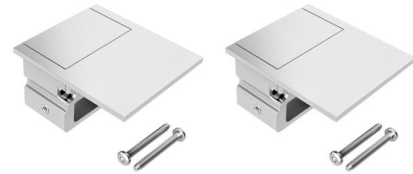
Shown in satin aluminum

End Caps for Light Channel Millwork. Provides a finished look at the end of a run and holds power connector. Finish: Satin Aluminum, White or Antique Bronze. Sold in pairs. Compatible with Edge Lighting Light Channel Millwork.