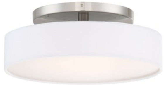
Shown in: Brushed Nickel / White

Manhattan Ceiling Light is an unequivocal transitional choice for both formal and casual spaces. Beautiful ambient lighting makes this perfect in any room of your home. Features a fabric shade, polycarbonate diffuser and Brushed Nickel finish. TRIAC and ELV dimming.